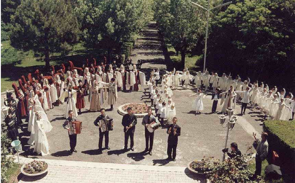
Stylised depiction of Circassian dance party.