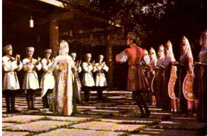
Circassian dance party.

A dance party was started with the stately slow dance «къафэ» ( qafe ), 4 and ended with the solemn round dance «удж» ( wij ), in accordance with the saying, «Джэгур къафэКІэ кыщІадзэри, уджКІэ яух» ( Jegwr qafech'e qisch'adzeriy, wijch'e yawix' ) [ 'A dance party is started with «къафэ» (qafe), and ended with «удж» (wij)' ]. Male dancers had to follow the moves of their female partners and harmonize with them. A female dancer always stayed on the right of her partner, and never associated with dancers of lesser social rank. 5 When a prince joined a dance party and took the floor, the bards paid deference to his noble demeanour by playing songs associated with his family and lineage, clapping and chorus assuming more sober and measured rhythms.