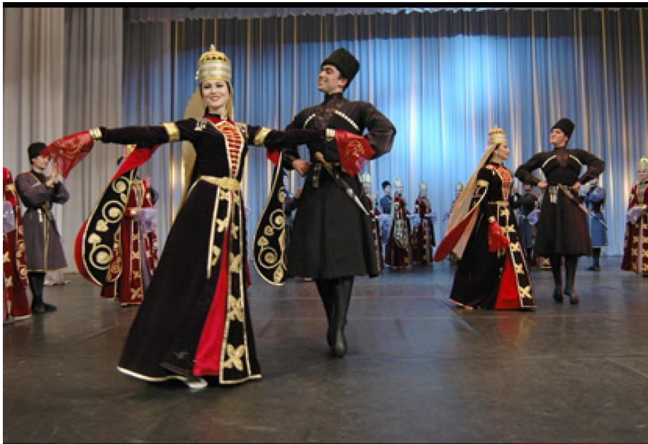
The Adigean State Academic Folk Dance Ensemble ‘Nalmes’. Established in 1936, ‘Nalmes’ sees itself as ‘the collector, guardian, and interpreter of Adigean folk music and dancing’.

‘Nalmes’, a folk song and dance group which was set up in the early 1970s, although it was first established in the 1930s, but was later dissolved. 6