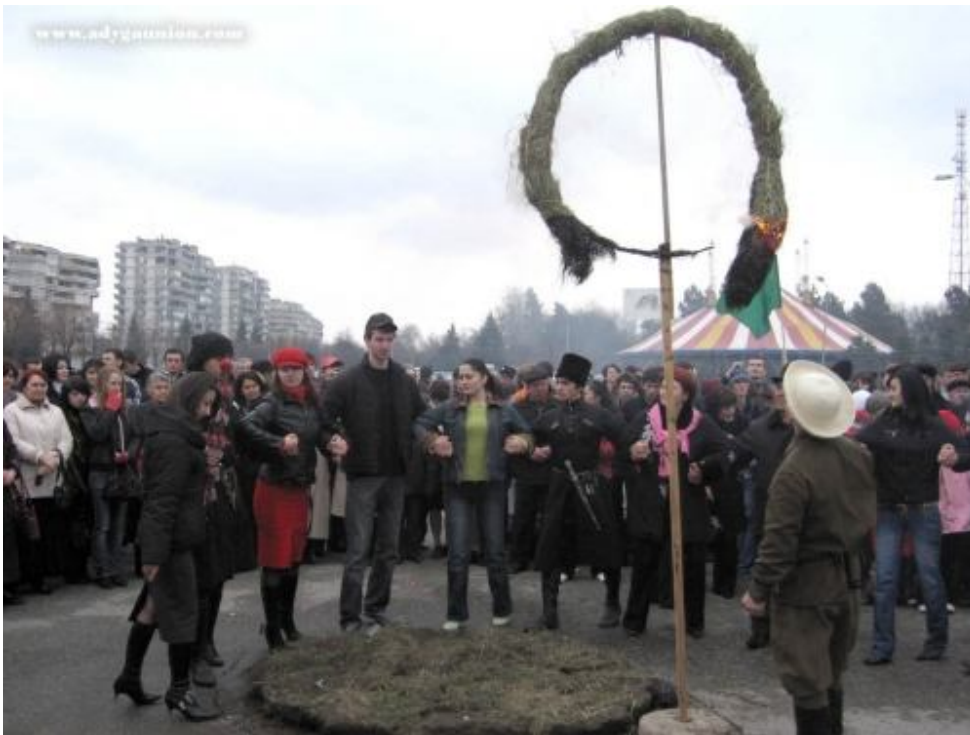
Dancing round a Fire/Cross in celebration of the Circassian New Year, 22 March 2007 in Nalchik. The round turf represents God's Field. The animist-cum-Christian rite is a phenomenon of the eclectic nature of the Circassian system of beliefs. The kindred Abkhazians are more avowedly animist-pagan, despite the fact that the majority are formally Christian, still clinging tenaciously to their old traditions and rituals.