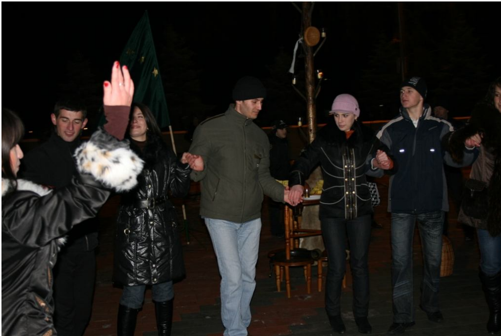
Modern-day Circassians celebrating the Birth (or Return) of the Sun (дыгъэгъазэ; Digheghaze ) on 22 December 2007 in Nalchik. This is the time when the sun reaches its lowest apparent point in the sky and starts to rise up, a propitious occasion for an agrarian-pastoral society. This is one of a number of pre-historic festivals that have been resurrected in the new millennium. The pole in the background is the principal emblem of this celebration. The round loaf of bread high on the pole is an ancient folkloric depiction of the sun-god.