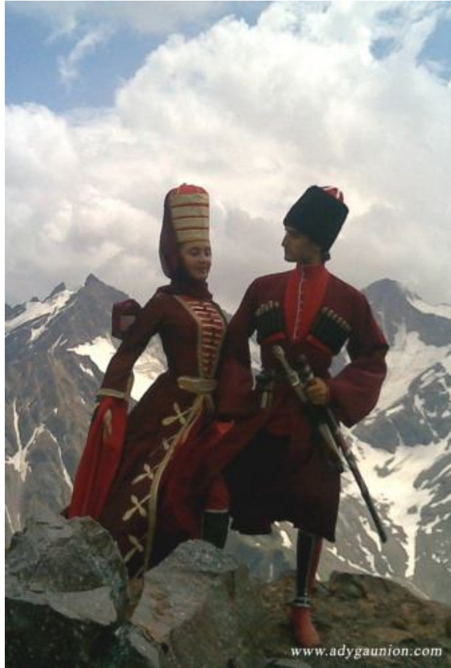
Two members of the National Dance Ensemble 'Hetiy' on top of the Caucasus Mountains.