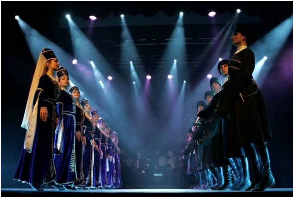
Al-Ahli Circassian Dance Troupe 'Kuban' performing under Royal patronage in Amman/Jordan in March 2009.

In the diaspora, dance is the main, and often the only, manifestation of national folklore. In many societies it is the activity most identified with Adiga culture and is readily associated with it by non-Circassians, perhaps to the detriment of other folkloric genres.