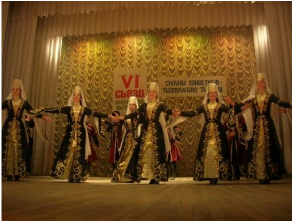
Circassian dance troupe from the Shapsugh Region of Circassia.