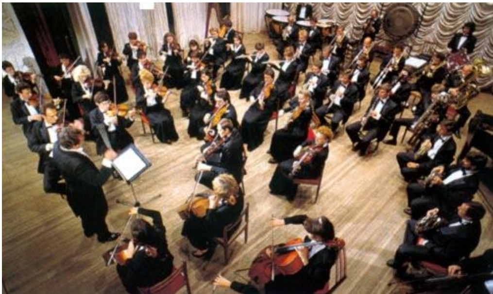
Symphony Orchestra in Adigea. (The Republic of Adygea, p19)